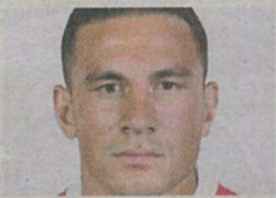
SONNY BILL WILLIAMS blowing up balloons at Courtyard Cafe Coogee Ricky, Coogee